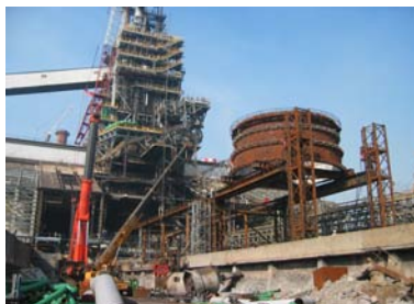
Power & Industrial